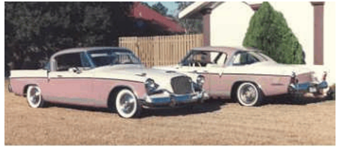
Vroom mates - No matter how you look at it, the 1956 Golden Hawk makes a bold statement

can point out the deficiency. When a similar situation occurs in the future, we tend to wax eloquently, by repeating what we heard before. We become the copy cat.