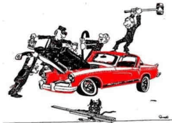
Drawing by Ron Meyer

Motor Life January 1956 Ken Fermoye: "I was able to get around the not-too-steeply banked corners at close to an indicated 90 mph. The car felt solid at those speeds, gave no indication that it was near the point of breaking loose. Over the various paved road courses at the proving